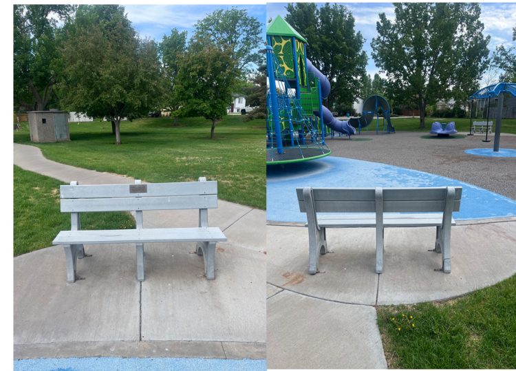
4. Windsor Village Park