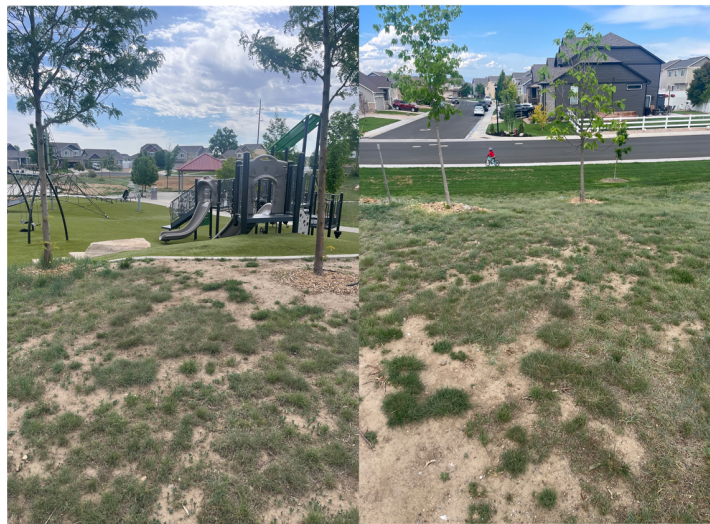
5. Village East Park