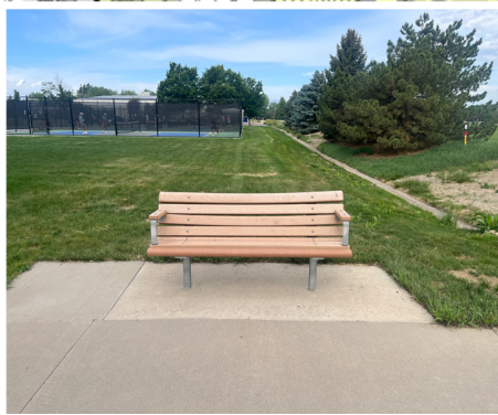
1. Windsor Highlands