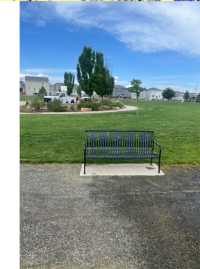
3. Poudre Heights