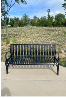
2. Coyote Ridge Park